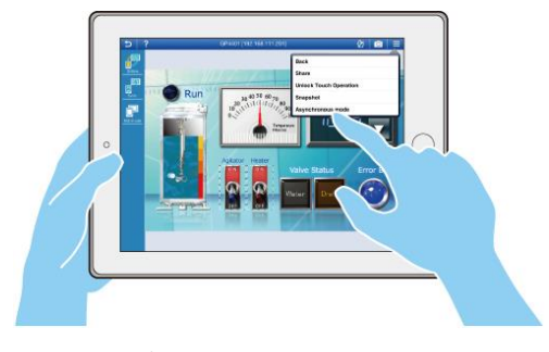
Fig. 4: HMI DISPLAY

As the name suggests, it is a human friendly machine used to interface Human with the machines running on the system. Input to the machines can be given through HMI and output can be displayed on it also.