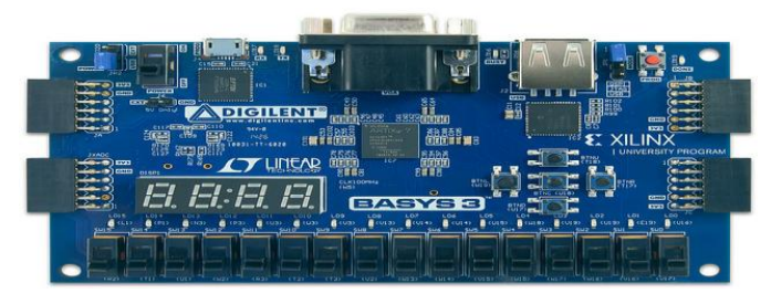
Fig. 2: FPGA Basys 3 Digilent board