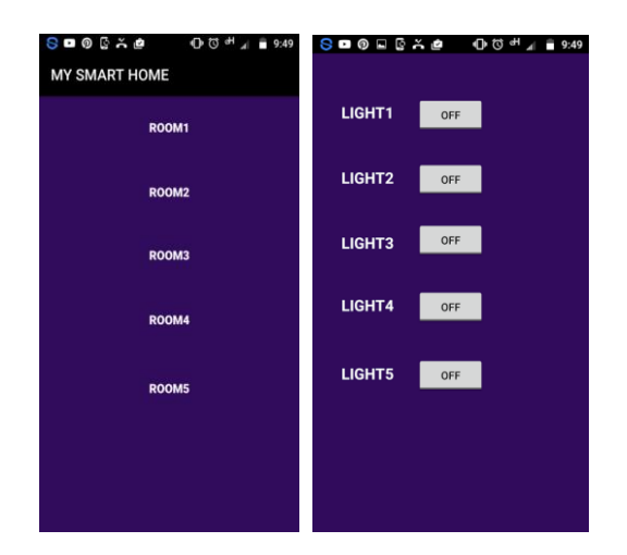
Fig. 1 Android Application.

The smart phone application is used to control various appliances that are connected to digital pins of Arduino through relays switches. When the ON OFF toggle buttons on the android application are pressed, synonymous signals are sent from application to the Bluetooth modules hooked up to Arduino device. There are predefined signals values stored in Arduino program. The micro-controller compares signal value sent with that assigned for each appliance. When it recognizes that signal, then the Arduino energizes the respective relay coil connected to its digital pin by passing 5V through it. Thus the appliance connected to relay is switched ON. To switch it OFF, Arduino passes logic low to its digital pin. Fig. 1 shows android application as designed for our system. LIGHT 1~5 labels are used, which corresponds to five appliances in a room, (names can be changed according to appliances controlled).